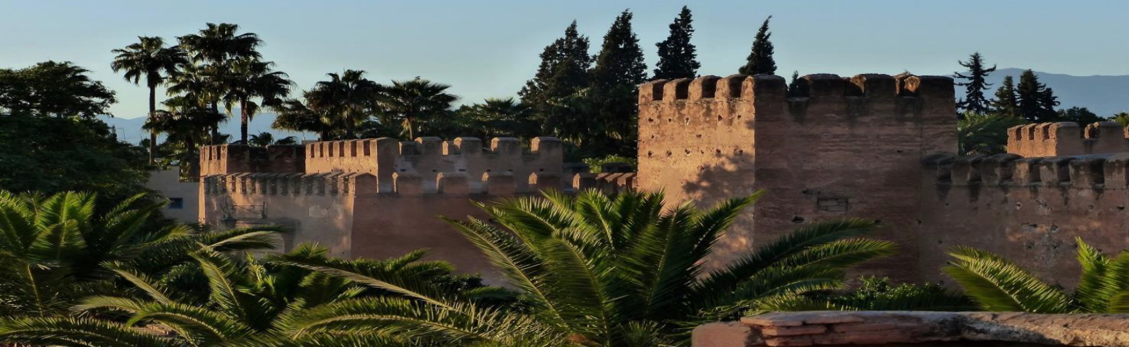
The walled town of Taroudant

"I went on Celia's singing holiday and loved every minute. This is a very well-run guest house with lovely staff and food. I felt totally spoilt. The rooftop singing morning and evening was very special." Liz Penny